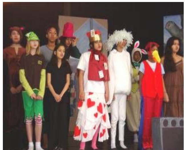
Alice cast members in full song, see opposite