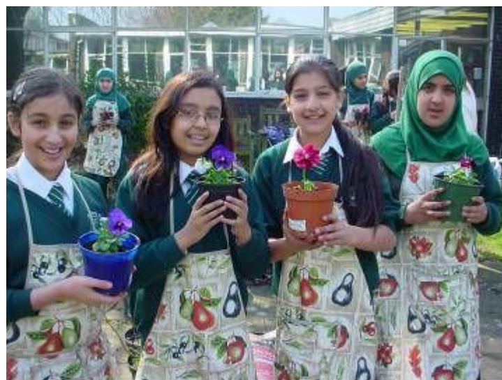
Garden Club members showing their potted plants for Mother's Day

As I drive down Stoneygate Road at this time of year I am always impressed by the blossom on the trees. We hope to incorporate some similar trees in the landscaping of the new site. This will both cheer us up as spring begins and remind us of the long history that Challney Girls' School has on this site.