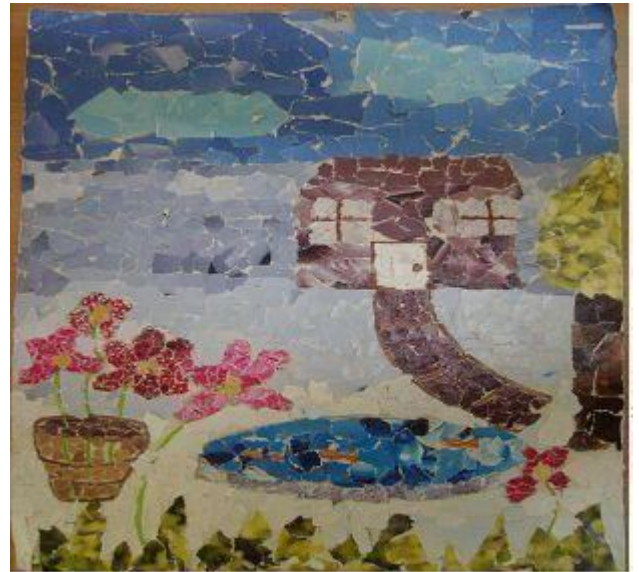
Nasreen Akhter, 90 produced this colourful collage