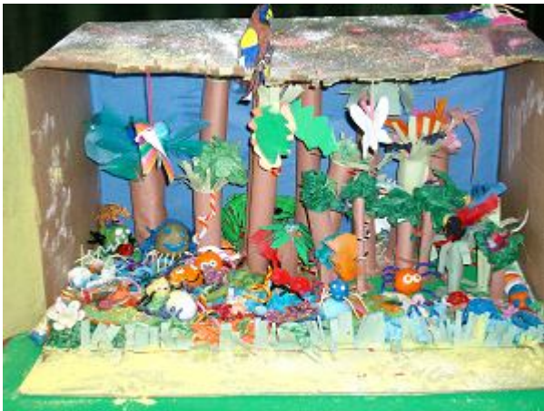
One of the Year 8 colourful tropical rainforest dioramas made during Enrichment Day