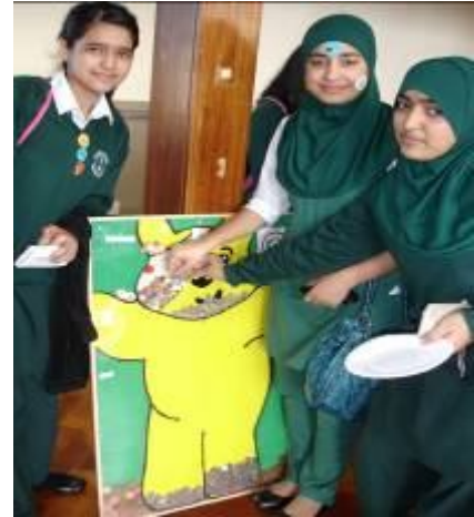
Girls raising money for Children in Need with the help of Pudsey Bear