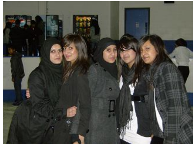
Year 11 ice skaters enjoying their reward for good attendance