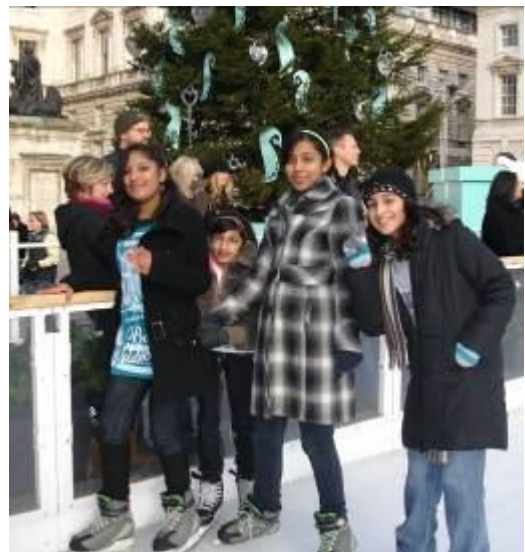
Year 8 attendance reward trip to London