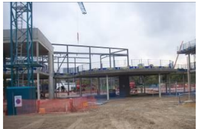
The front entrance and library of the new school building under construction