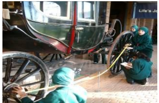
7M visited Stockwood Park during Science and Maths Enrichment Day where they investigated some of Queen Victoria's carriages. In this photo the girls were measuring wheel diameters.