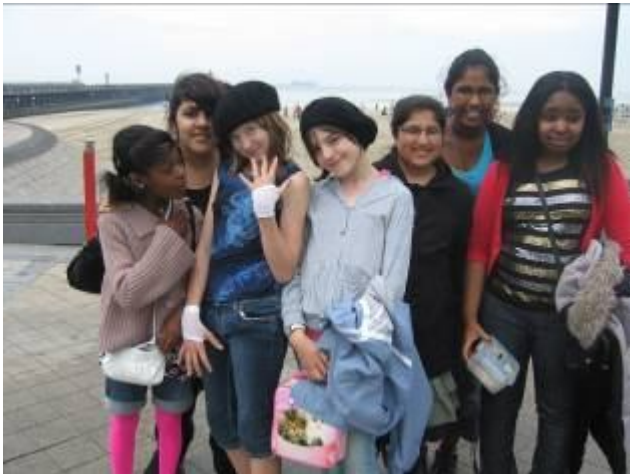
Year 8 girls on this year's day trip to Boulogne