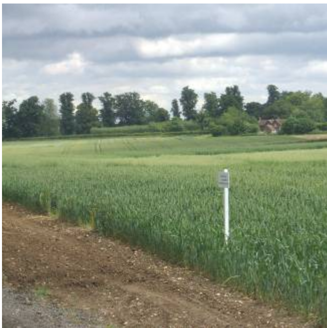
The Broadbalk at Rothamsted