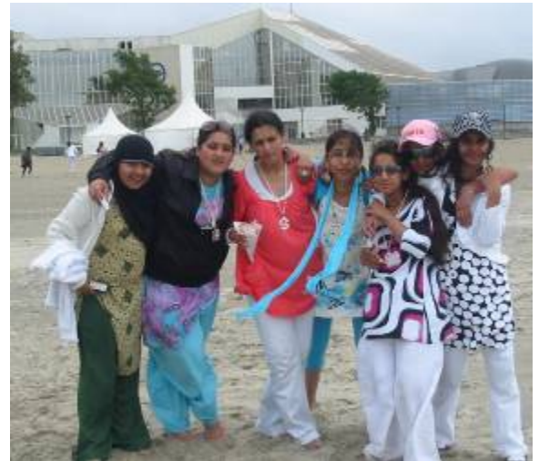
A happy day at Boulogne between the showers

During the month of Ramadan only a few girls eat lunch. To make most productive use of time and to avoid boredom at lunchtime it has been our recent practice to shorten the school lunch hour to forty minutes, start afternoon school early and finish school at 3pm. The Governors have agreed that we will continue this practice this year. The changed