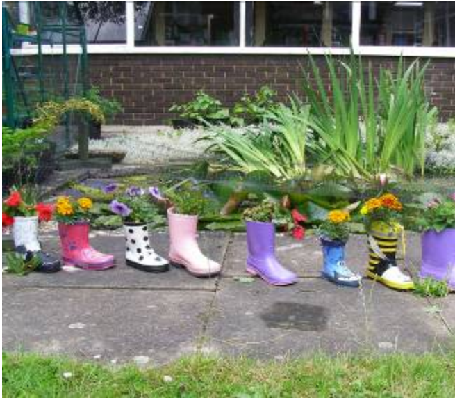
'Wellies on Parade' at the Garden Club