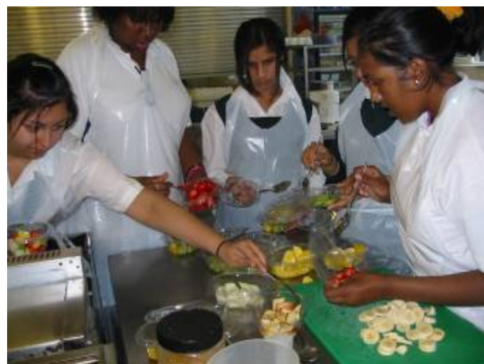
Pupils leading eating and tasting of healthy food