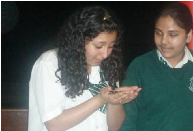
Year 9 pupil holding a tarantula