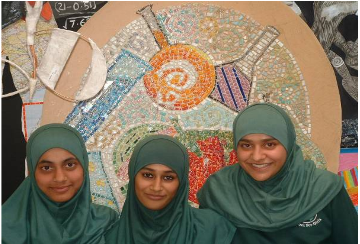
Students with their science themed mosaic