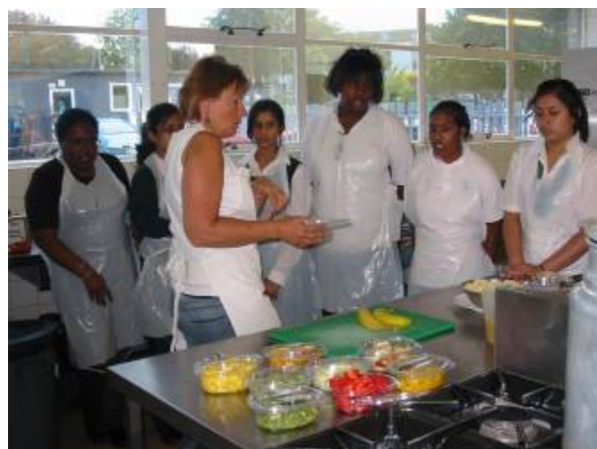
Mrs Peacock leading preparation of healthy food