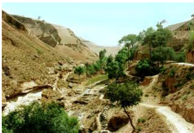
Desertification in the Loess plateau region of China: