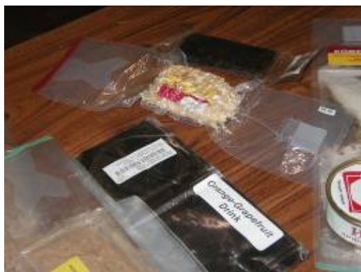
An example of "Space Food":