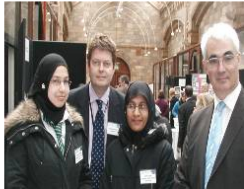
Two of our girls meet Alistair Darling MP

I think and hope that spring is now here. The girls get tired in the winter months and the colder weather often leads to some disruption. I hope you and your daughters enjoy the break and the girls come