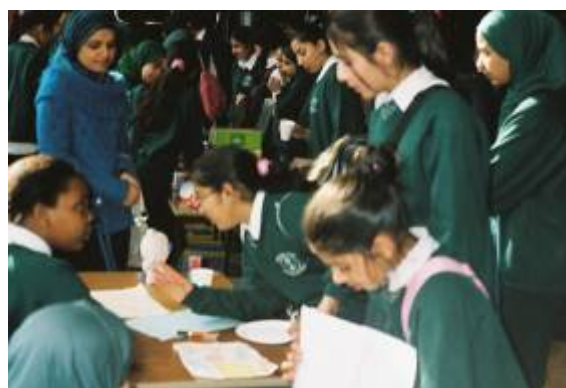
Year 7 Fundraisers hard at work

Altogether, they organised over 50 different fundraising events, ranging from food sales to talent shows and from car washes to guess the name of the teddy. Of course, they were very enthusiastically supported by staff who share their commitment to helping those less well off than themselves or in greater need.