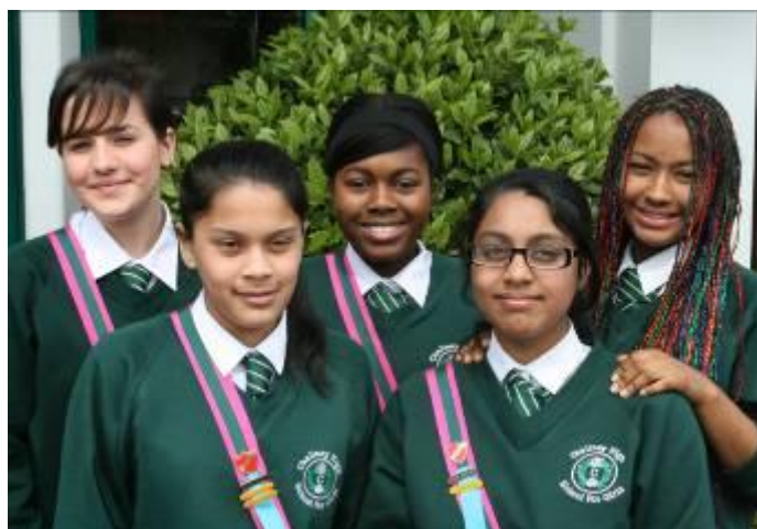
The new Senior Prefect team for 2008-9