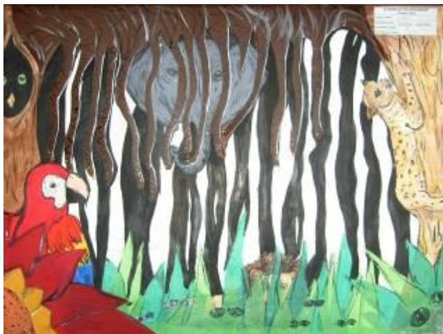
GCSE Art work by Abigail Grover, 11G