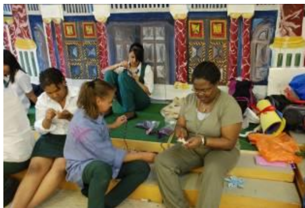
Preparing costumes for the Luton Carnival