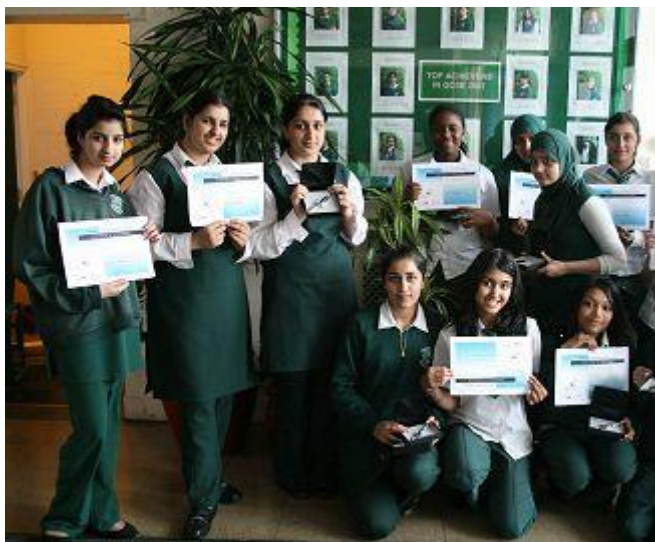
MEAP Award: Delighted girls with their certificates recognising their participation and achievement.