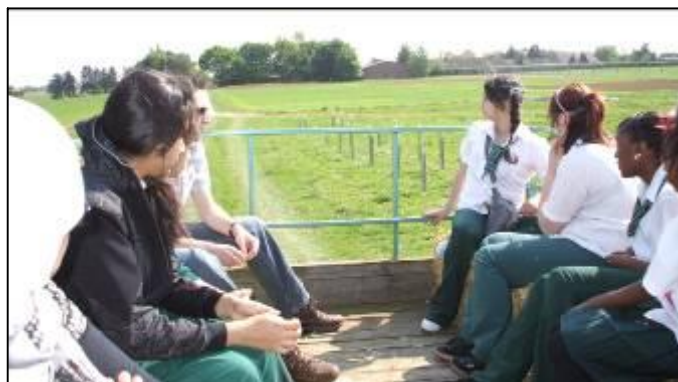
Applied Scientists visiting Brooms Barn Agricultural Station