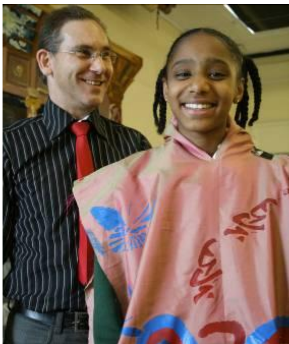
Fitting a costume for the Luton Carnival