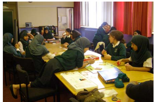
The lunchtime drop-in with the Learning Mentors