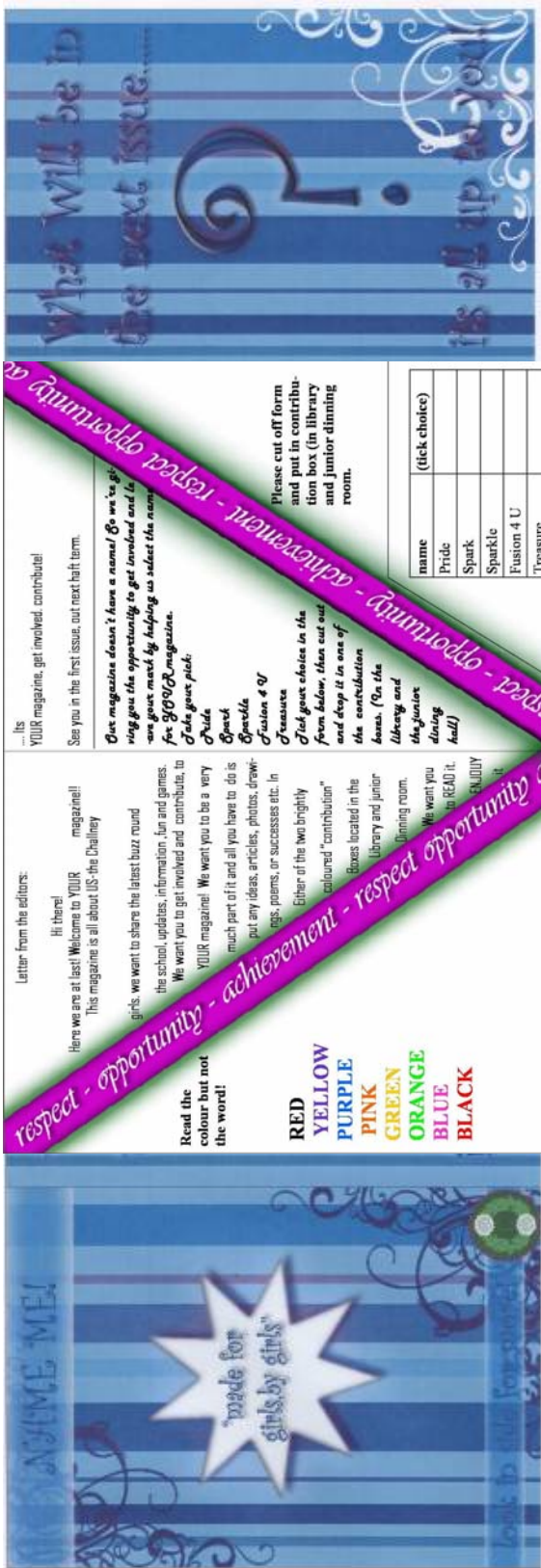
The hard work of the girls' editorial committee after their first two weeks working together. See the school website for the full size version and for future editorial committee publications.