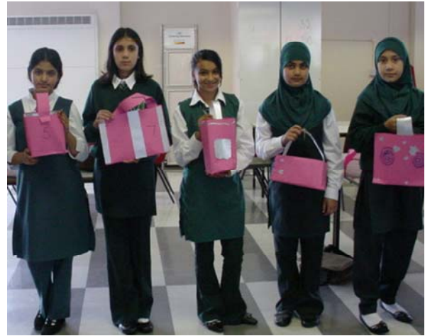
Year 7 are proud designers

The girls really enjoy seeing mum and baby and they are a constant source of pleasure and enquiry. Welcome!