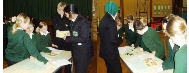
Maths Leaders at Parklands Middle School