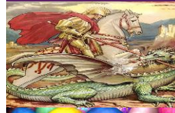
St George's Day (April 23 rd )