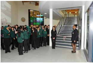
Students cutting the ribbon.