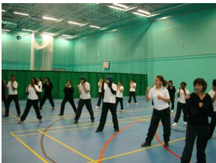
Pupils enjoying a boxercise session

Boxercise, too, was introduced a few weeks ago and has proved as popular as self-defence. In this, pupils develop their spatial awareness and coordination, as well as key skills in protecting themselves. The sessions are run by Luton's Boxing Development Officer. They are fun, high energy sessions that are aimed at all ages.