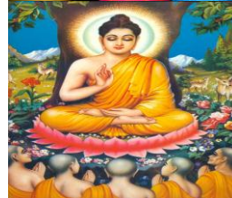
Wesak (May 17 th )