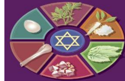
Pesach (April 19 th )