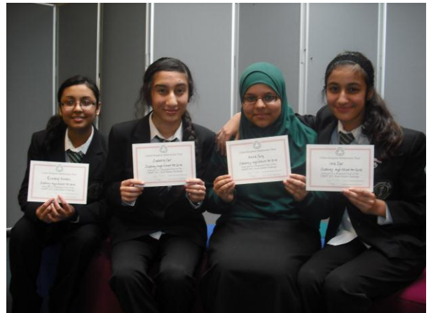
Proud Maths Leaders show their certificates