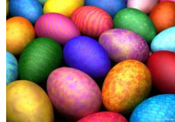
Easter (April 24 th )