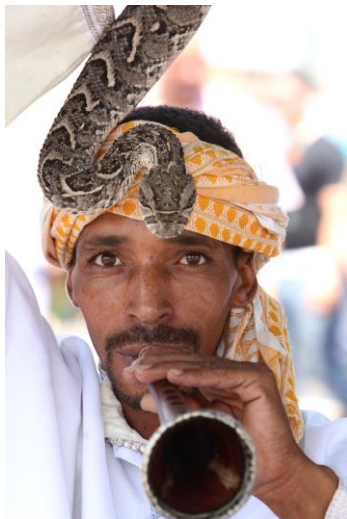
A Marrakechi snake charmer

The trip is open to all pupils currently in years 7, 8 and 9. If you would like your daughter to take part, please attend a parents' evening at the school on Tuesday 17 th May